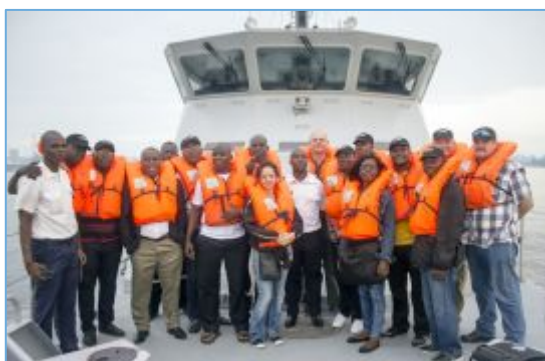
Figure 5: The 1st Regional Training Workshop of the WATF - Abidjan, Côte d'Ivoire

Supporting and facilitating the development and strengthening the skills, instincts, abilities, processes and resources of fisheries officers and stakeholders in the fight against IUU fishing, SIF was active over the course of the year through various capacity building forums aimed at strengthening and harmonising human and institutional fisheries management efforts.