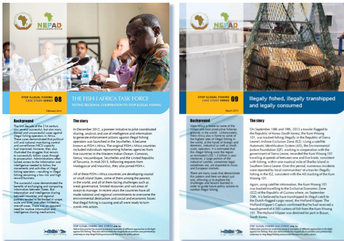
Figure 02: New SIF Case Studies